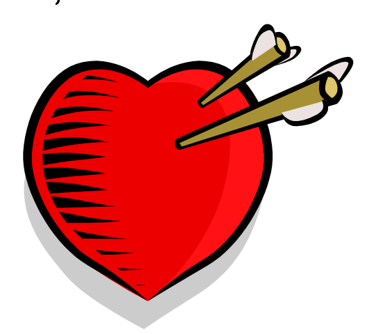
Happy Valentine's Day! Valentine parties on Wednesday, February 14th at 2:30!

Social Studies: This week we will be learning about how something becomes a symbol of the United States. We will also be creating symbol portraits.